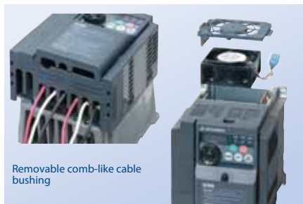
Cabling and fan replacement made easy

The fans are designed as compact units that can be replaced in less than 10 seconds for cleaning or in the event of failure.