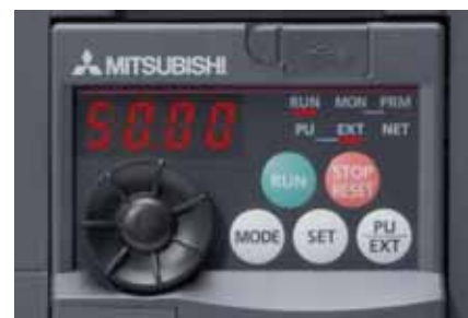
The built-in multi-user panel with Digital Dial

In addition to entering and displaying various parameters, the integrated four-digit LED display also monitors and displays current operating values and alarm messages.