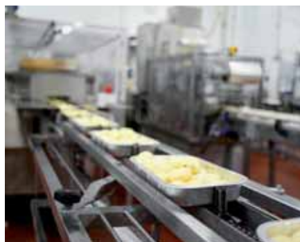
Conveyor belts and chain conveyors are an ideal application for the FR-D700.