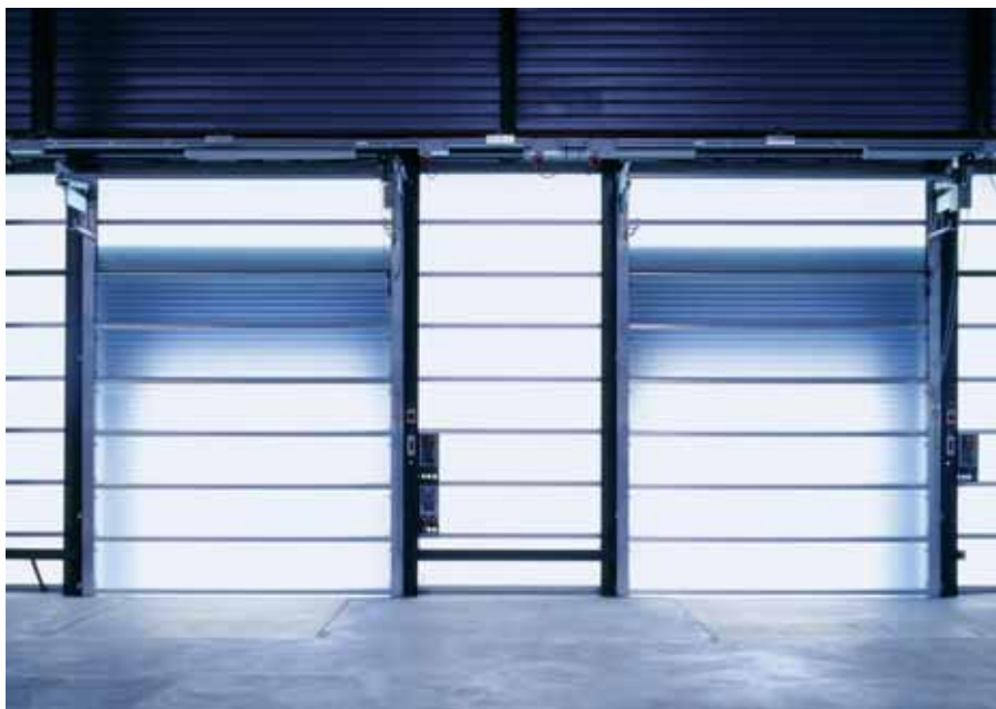
Door and gate drives are only some of the multiple applications of the new FR-D700 series.